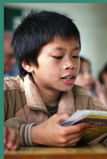
Reading programs at the new You Dao Family Centre