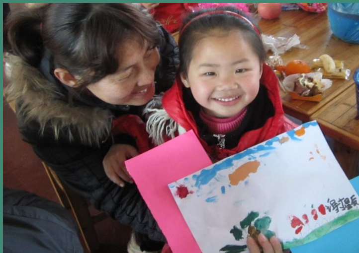
Various workshops for adults and children at the new You Dao Family Centre in Fengxian